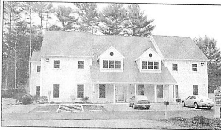
... and the new 8,000 square foot two story office building and residential complex owned by Fran Doran on Enterprise Street near Cox's Corner. Also in the works is construction of a new clubhouse at North Hill